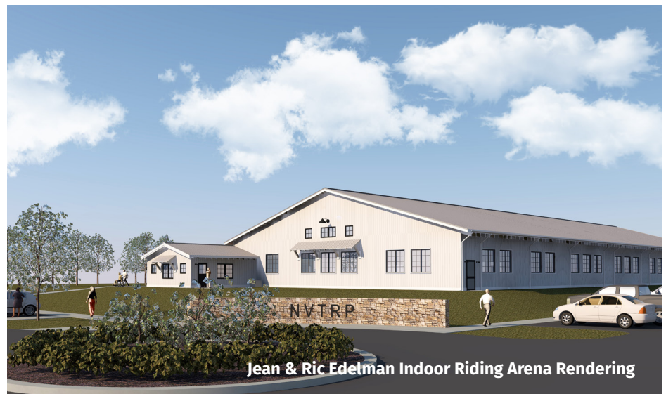
Jean & Ric Edelman Indoor Riding Arena Rendering

Extensive environmental conservation and fire protection measures